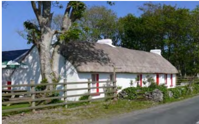
The original Rose Cottage in Malin is our base

To mark the occasion of the first Anniversary of Rose Cottage and to thank all those customers who have helped to make it such a success we thought we would prepare a summary of just a few of the things that have marked that year. This Newsletter is the result. There are too many events to cover in such a small space but we hope that you will enjoy reading just a few.