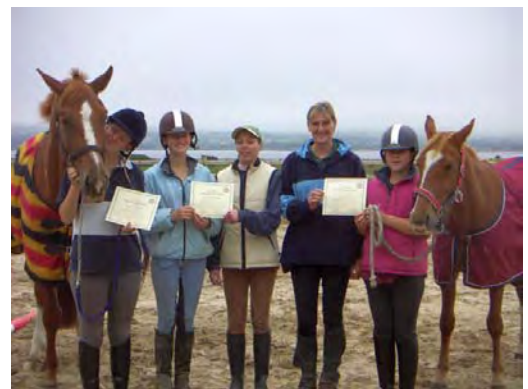
The 'seniors' with their Level 2/3 awards