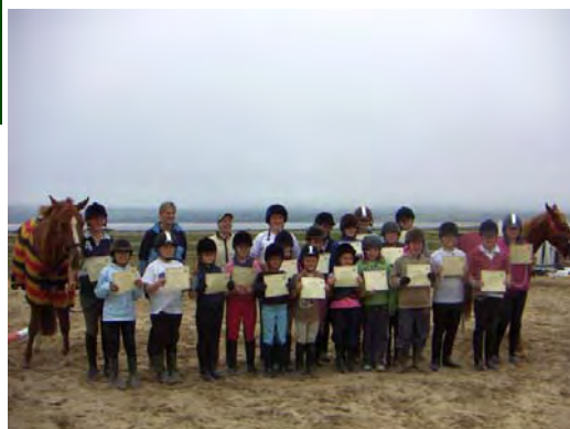
The Level one Winners with their certificates

Courses in Stable Management, Equitation and Road safety are conducted regularly.